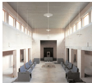
The Abbey Church